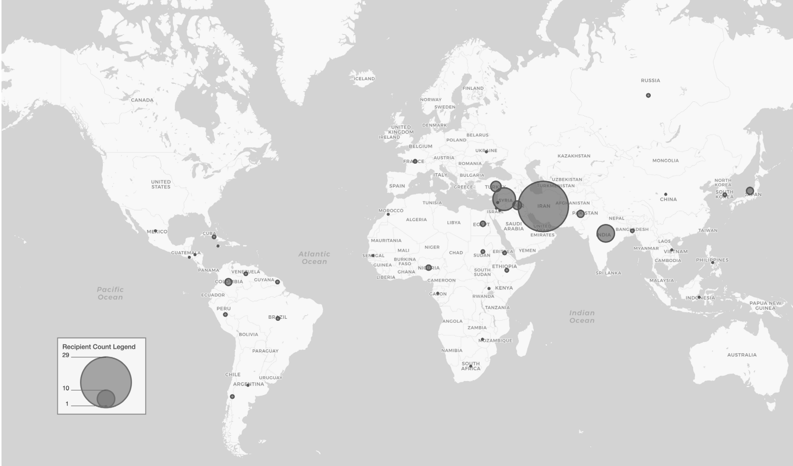
FIGURE 2 Origins of recipients of TAC Newcomer and Refugee artists mentorship grants — 2017 - 2022

A significant proportion of recipients come from only a few West Asian countries: 29 artists from Iran, 13 from Syria, 6 from Turkey, and 5 from Iraq, collectively representing 40% of the recipients. Beyond this group, recipients are distributed globally, but there is a clear predominance of artists from the ‘Global South’ or ‘non-Western’ countries. Notably, artists from East and Southeast Asian countries are relatively underrepresented compared to their populations and their numbers in overall immigration to Canada. Furthermore, nearly one quarter of PNR beneficiaries did not come directly from their countries of origin to Canada but followed complex migration pathways before choosing to resettle here.