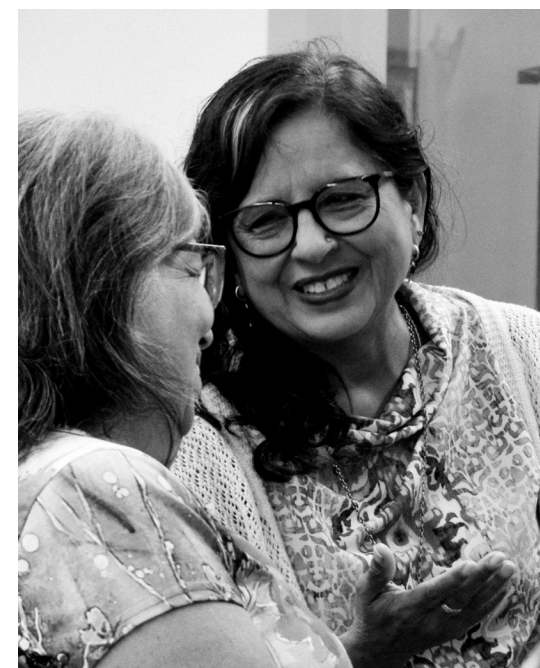
FIT- ART Policy Workshop – Fostering integration through the arts: Insights from practitioners. Hybrid event at The Catalyst, The Creative School, on TMU campus and virtual via Zoom, June 6, 2024.