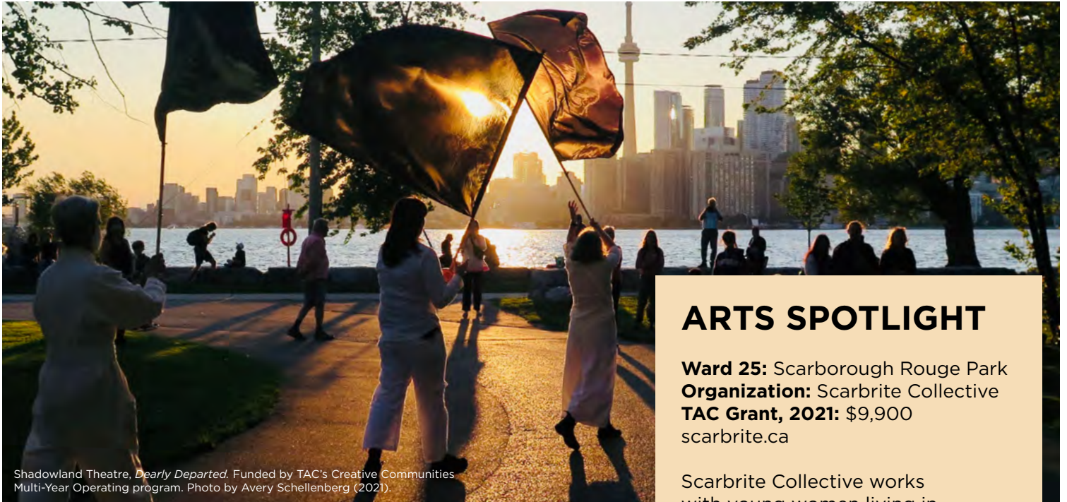
Shadowland Theatre, Dearly Departed . Funded by TAC's Creative Communities Multi-Year Operating program.