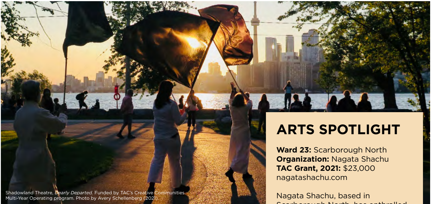
Shadowland Theatre, Dearly Departed . Funded by TAC's Creative Communities Multi-Year Operating program.