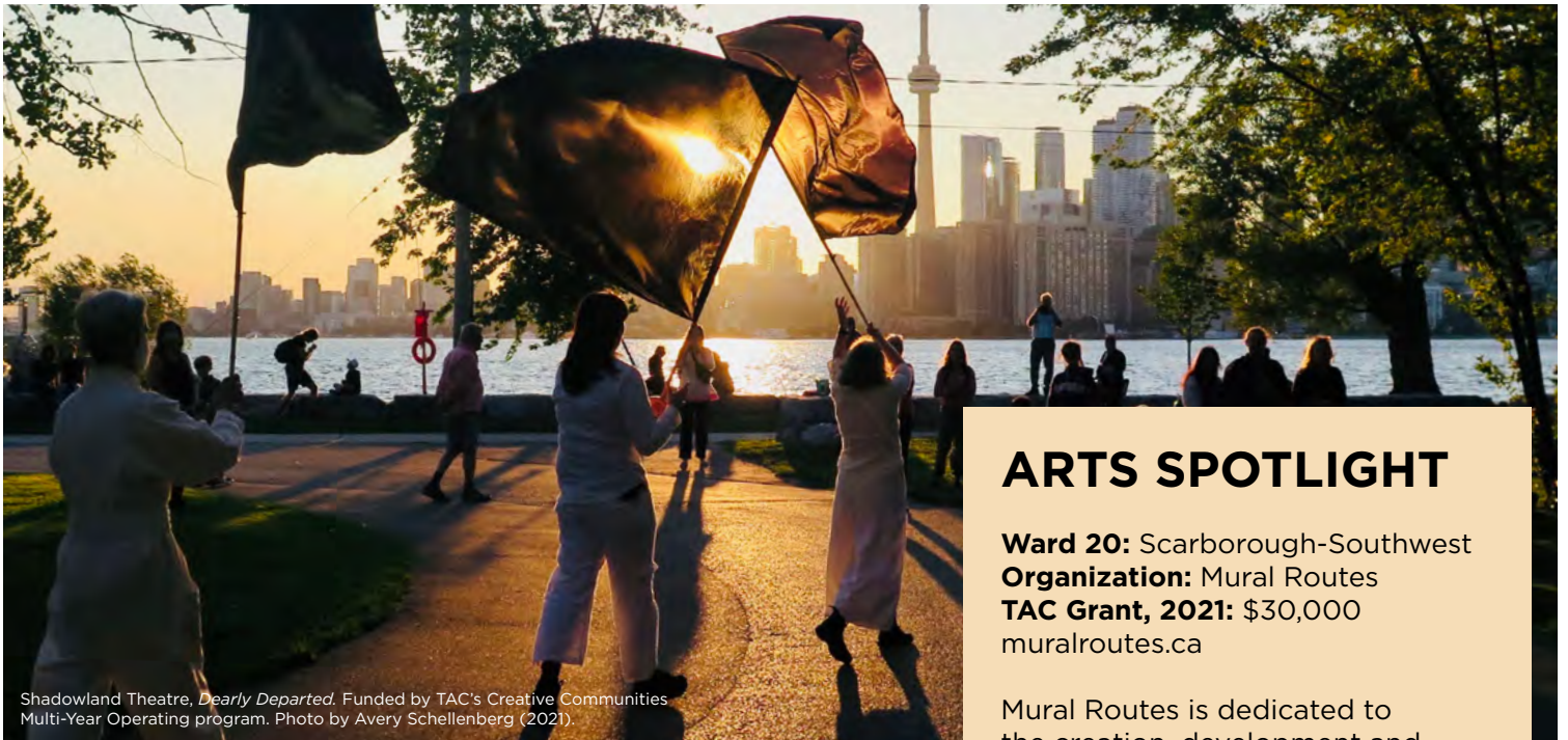
Shadowland Theatre, Dearly Departed . Funded by TAC's Creative Communities Multi-Year Operating program.