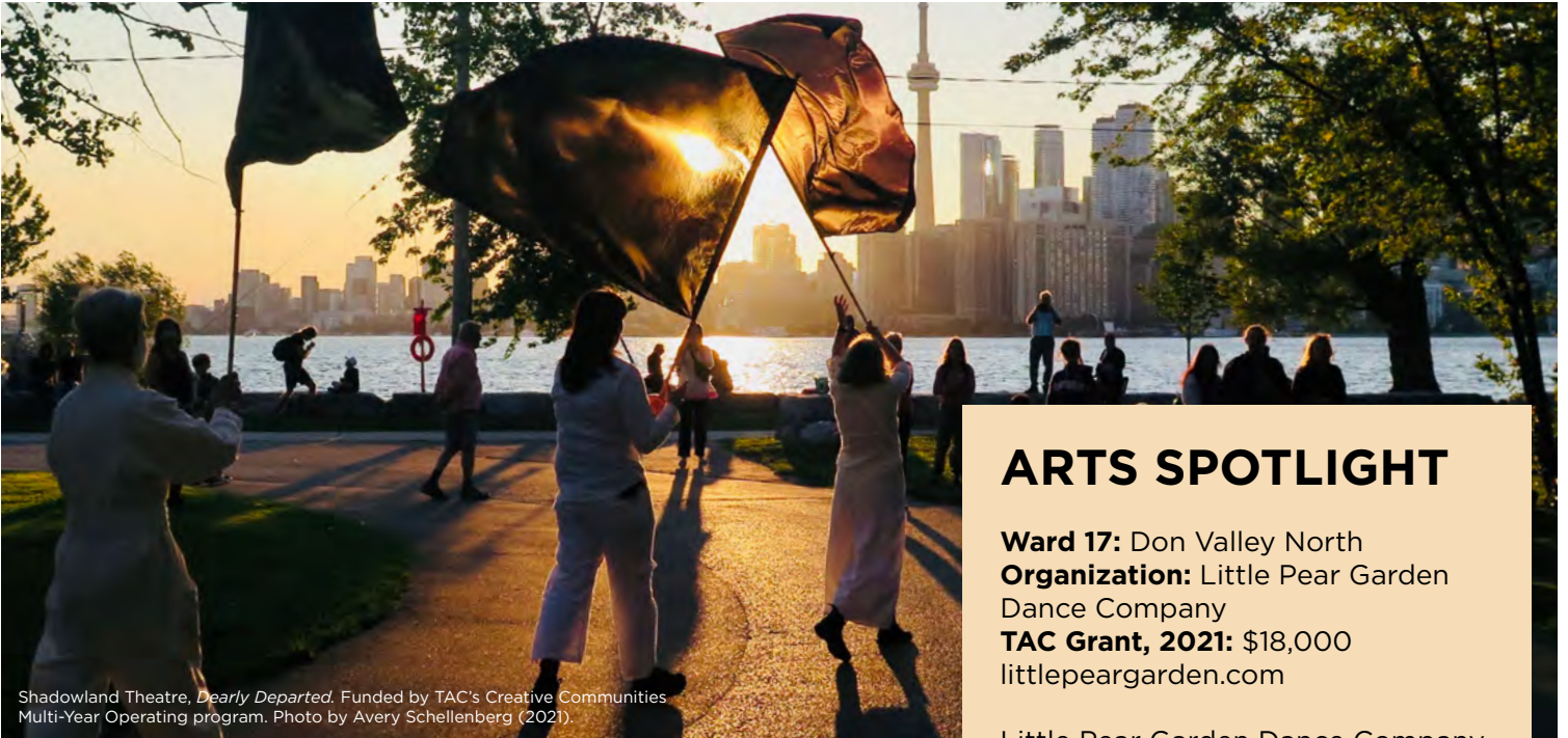
Shadowland Theatre, Dearly Departed . Funded by TAC's Creative Communities Multi-Year Operating program.