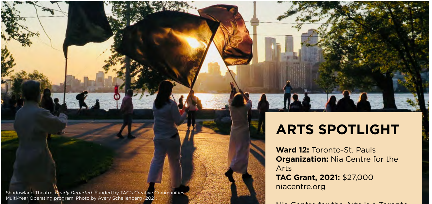
Shadowland Theatre, Dearly Departed . Funded by TAC's Creative Communities Multi-Year Operating program.