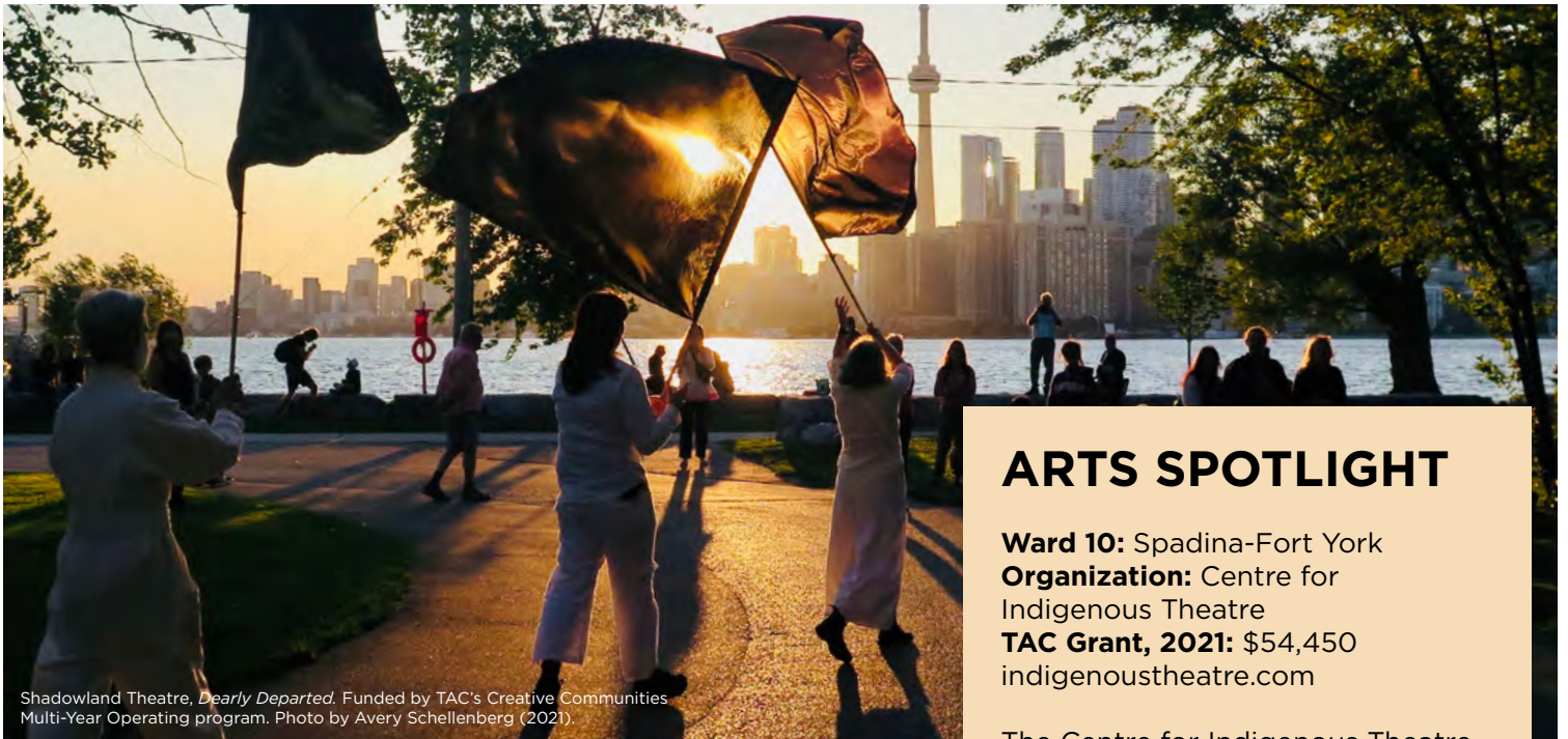
Shadowland Theatre, Dearly Departed . Funded by TAC's Creative Communities Multi-Year Operating program.