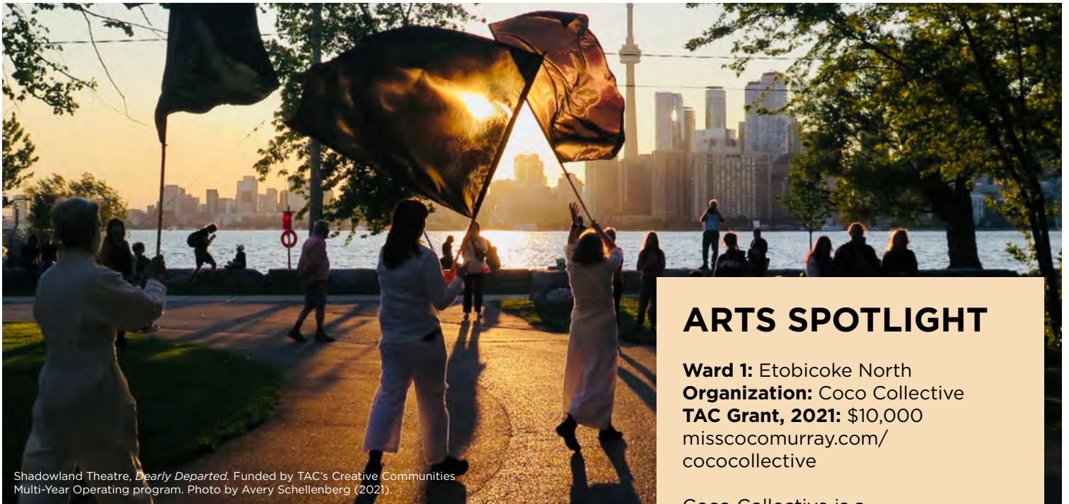
Shadowland Theatre, Dearly Departed . Funded by TAC's Creative Communities Multi-Year Operating program.