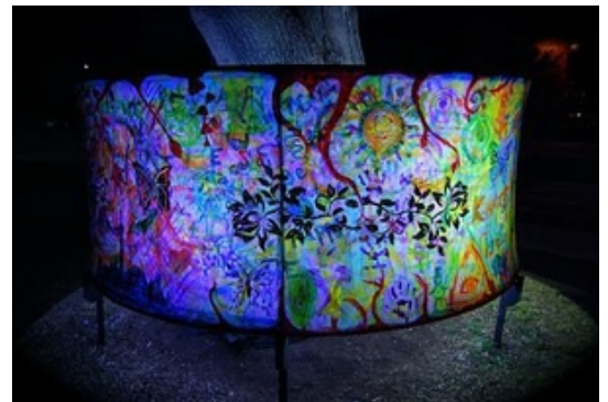
The finished product.

Throughout the evening, Nuit Blanche participants were invited to paint symbols, words, and images on the mural as links to themes of creativity, community, and equity. Using non-toxic sheer high gloss paints, the 7 ft tall cylindrical free-standing structure that glowed from within gradually became an illuminated installation that celebrated the impact of the arts in our neighbourhoods and the collective creativity of all of Toronto's diverse people. We think it turned out beautifully. What a great night for everyone!