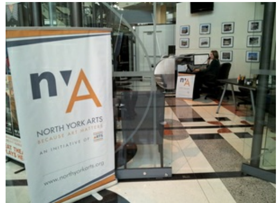
The new North York Arts office.