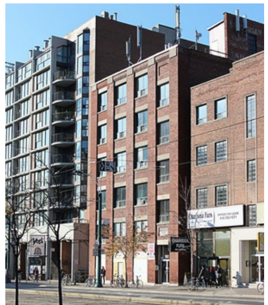
192 Spadina.

The Community Bond is an interest-bearing loan that allows a nonprofit to leverage its community of supporters to pursue its mission, build its resiliency, and create more vibrant communities. The investment earns you an annual return, is backed by the underlying asset (in this case, a building), and has a social and environmental benefit. Find out more at http://socialinnovation.ca/communitybond .